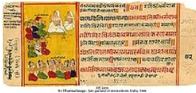
Figure 2: Upadeshmala

postpositions, and auxiliary verbs. While generally known as Old Gujarati, some scholars prefer the name of Old Western Rajasthani, based on the argument that Gujarati and Rajasthani were not yet distinct. A sample of Old Gujarati is provided below from the Updeshmala, Manuscript in Jain Prakrit and Old Gujarati. The Old Gujarati prose commentary was written in 1487 6 .